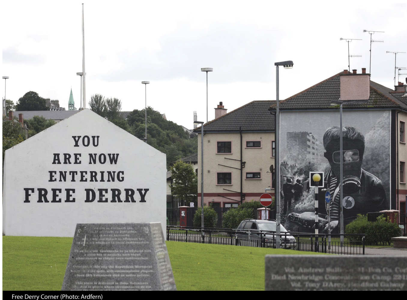
Free Derry Corner

profound ideological somersault over the course of the Troubles, eventually adopting a partitionist and pro-British outlook.