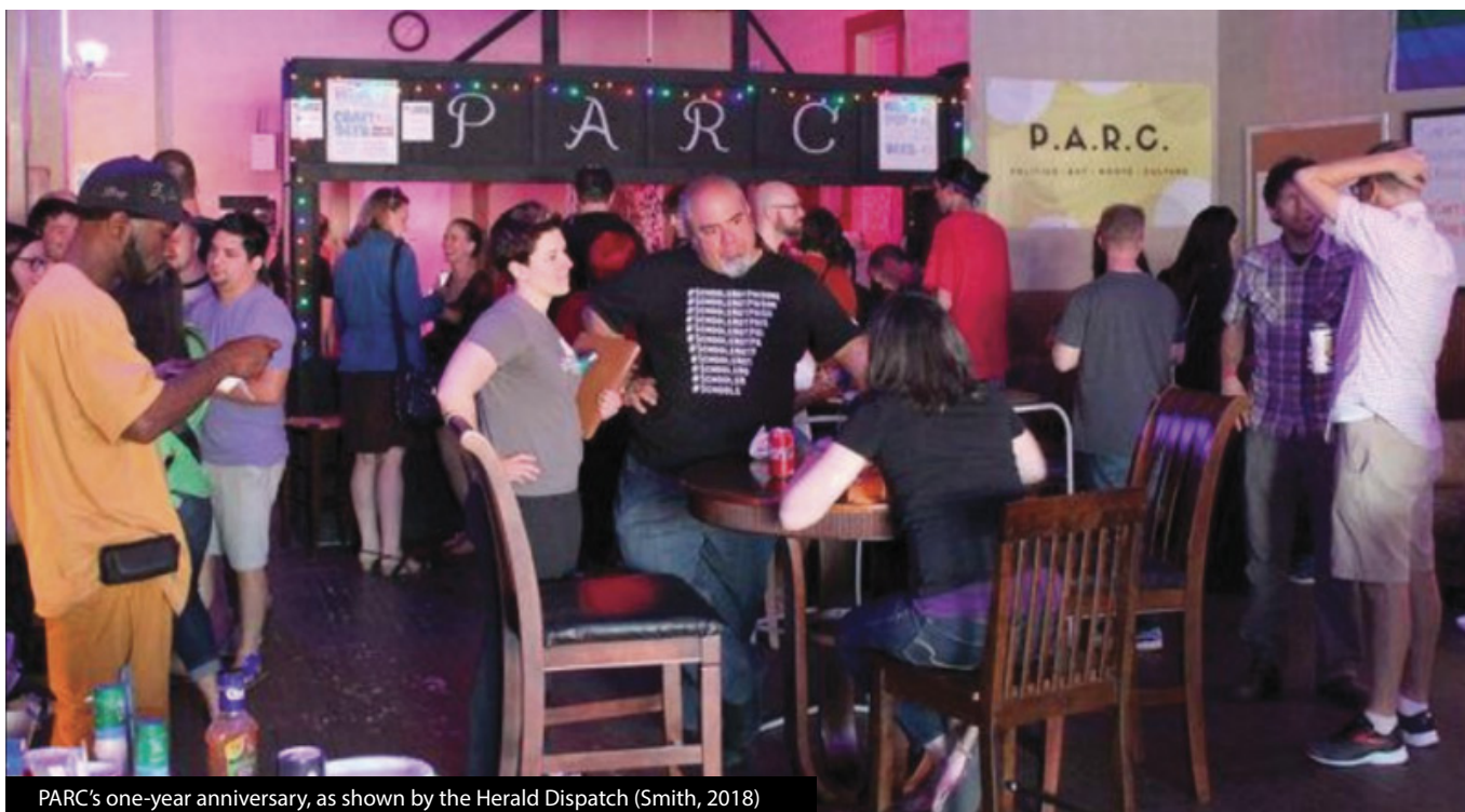
PARC's one-year anniversary, as shown by the Herald Dispatch (Smith, 2018)

I live in Michigan City, Indiana, on Lake Michigan. This is a city of about 30,000 people, in the rust belt, and with the majority of people (53%) living month-to-month. It's a city that's generally about two-thirds white, one-third African American, although race relations seem pretty relaxed; not perfect, but generally people at least tolerate each other, especially at the same economic status level. Our recently elected mayor is an African American woman, the first to win the position.